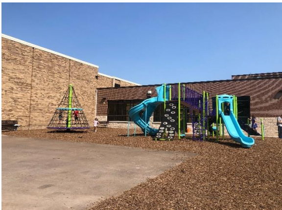
CES – Playground #2 Complete