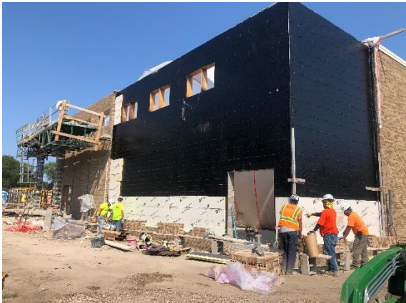
CES – Gym Addition