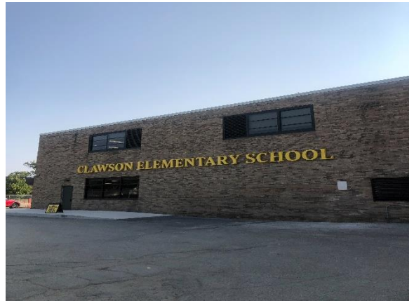
CES – CES Sign