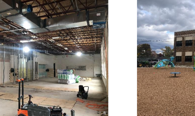
ECC – Overhead Electrical Install In Progress